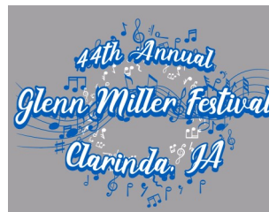
Front left chest logo