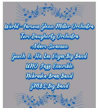
Logo on back

Styles, colors, sizes and sales of our Glenn Miller clothing changes often. Contact the Museum with any questions. If you have ideas on clothing you would like to see us carry, just let us know.