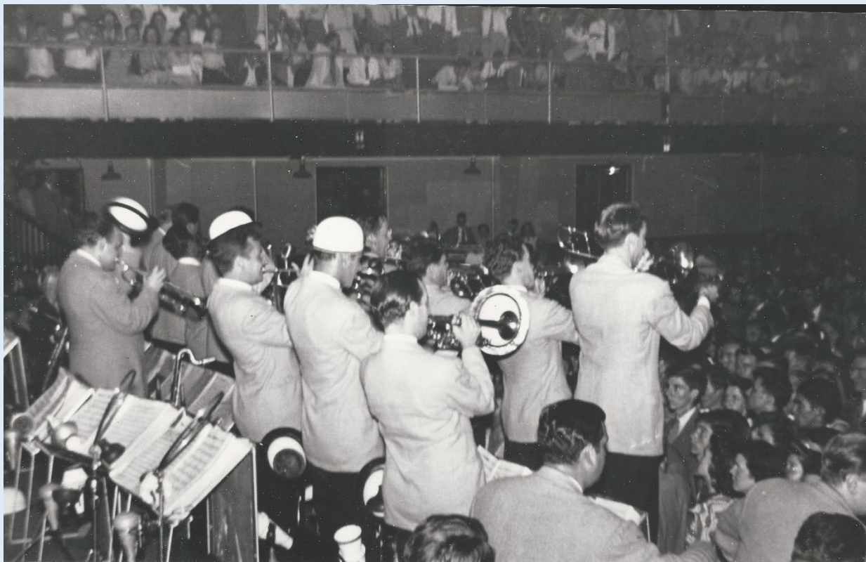
Waving the "fanhats" for 6,000 fans in Toronto

On January 7, 1942, the band completed their engagement at the Café Rouge. Charlie Spivak and his Orchestra opened on January 8, followed by Jimmy Dorsey. The Hotel Pennsylvania booked Glenn to return in October 1942.