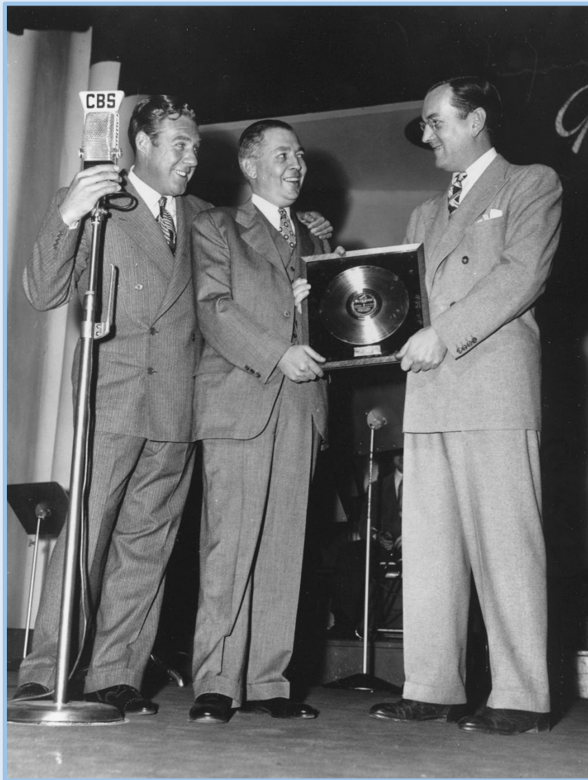
February 10, 1942 The First Gold Record

Glenn Miller recorded Chattanooga Choo Choo for RCA Bluebird on May 7, 1941 in Hollywood. 20th Century Fox featured it in Sun Valley Serenade , along with other Mack Gordon-Harry Warren tunes. The Miller band performed an extended version of the novelty in the film, along with a superb dance sequence featuring Dorothy Dandridge and the Nicholas Brothers. Among the Gordon-Warren tunes written for Sun Valley Serenade was the lovely ballad I Know Why and So Do You , which was featured as the showpiece tune. The producers and all concerned had every expectation that I Know Why would be the hit tune from the movie. Indeed, Miller recorded it, too, on May 7, and Chattanooga Choo Choo was the flip side of the same record.