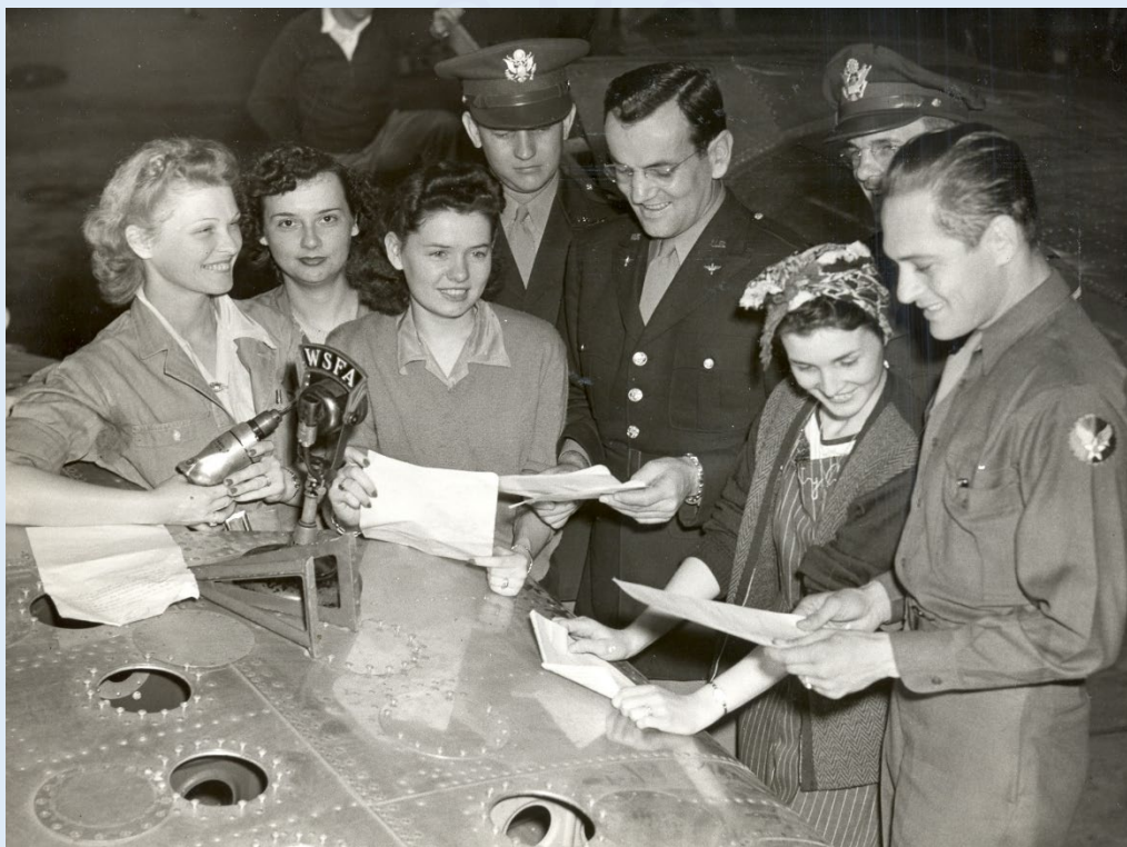
NBC "Army Hour" Broadcast from Maxwell Field