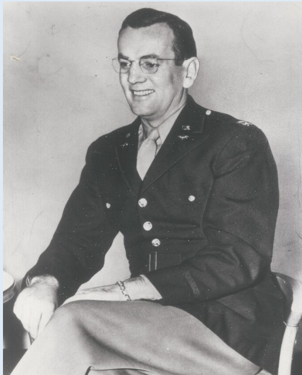
Capt. Glenn Miller, Army Air Forces