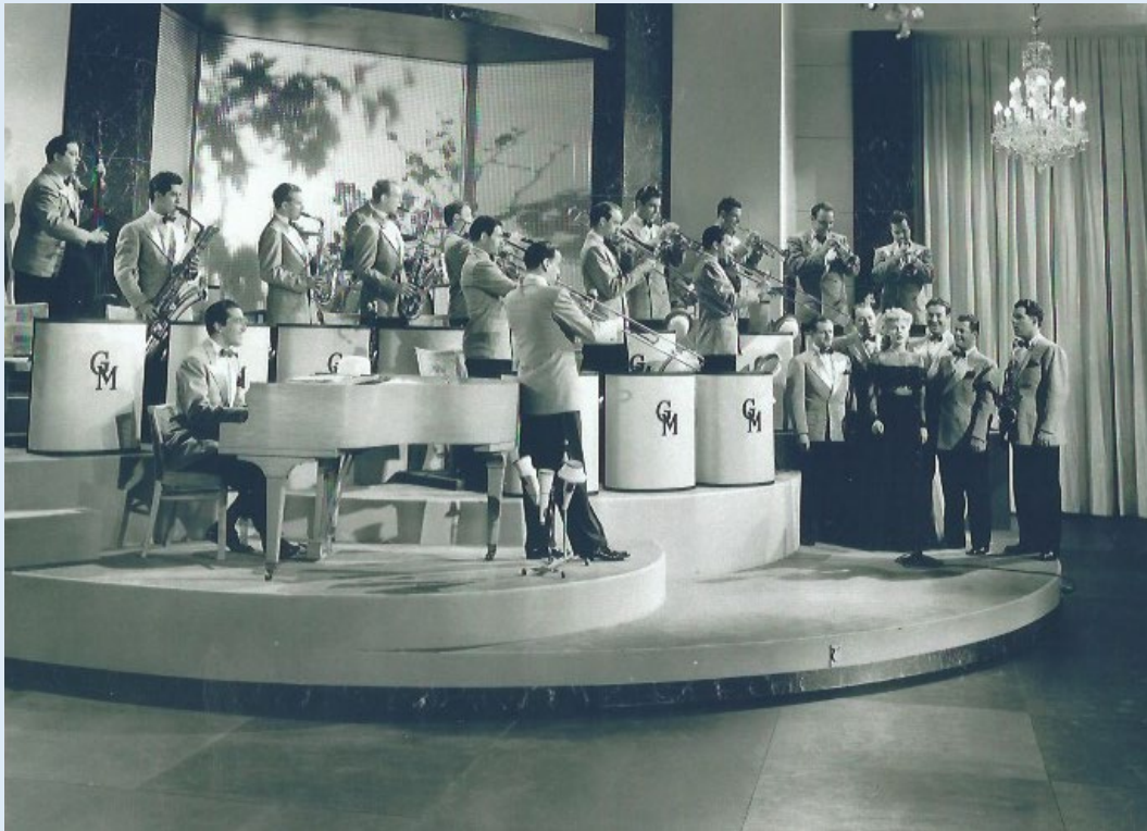
(I've Got a Gal in Kalamazoo) - Closing Scene