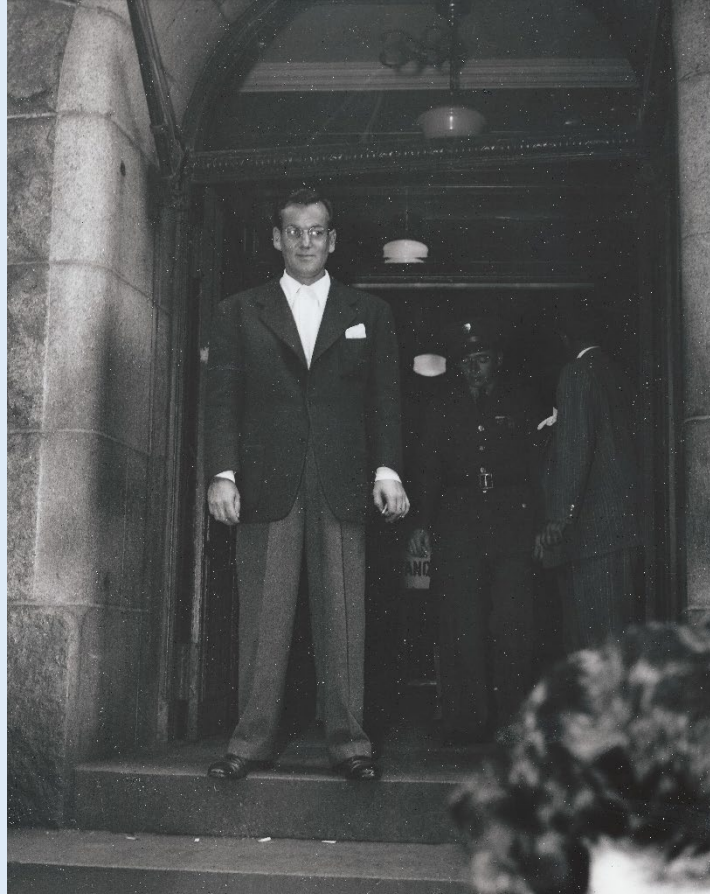
Glenn Miller Enlists September 10, 1942