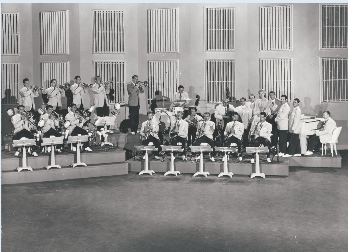
On the Orchestra Wives Set