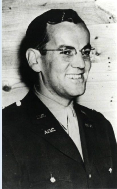
Capt. Glenn Miller, Army Service Corps