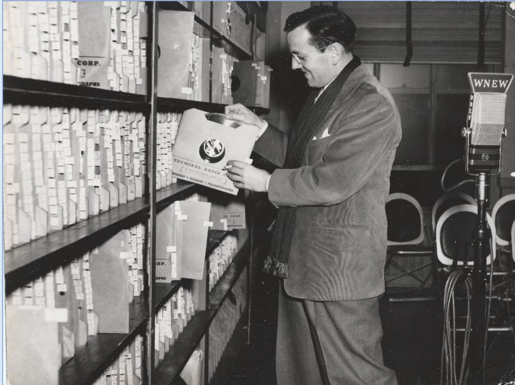
Glenn Miller at WNEW, New York, January 1942