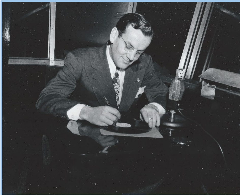
Glenn Miller autographs "At The President's Birthday Ball" for President Franklin D. Roosevelt

On January 1, by order of the Federal Communications Commission, NBC divested its Blue Network into a holding company, pending a sale to a new owner. The longstanding anti-trust case against NBC meant that the Blue Network would operate in a quasi-independent manner, although still tied to NBC for facilities, staff, technology and materials. Until the Blue Network was sold and became the American Broadcasting Company (ABC) in 1945, and beyond, all Blue Network programs and production remained at NBC.