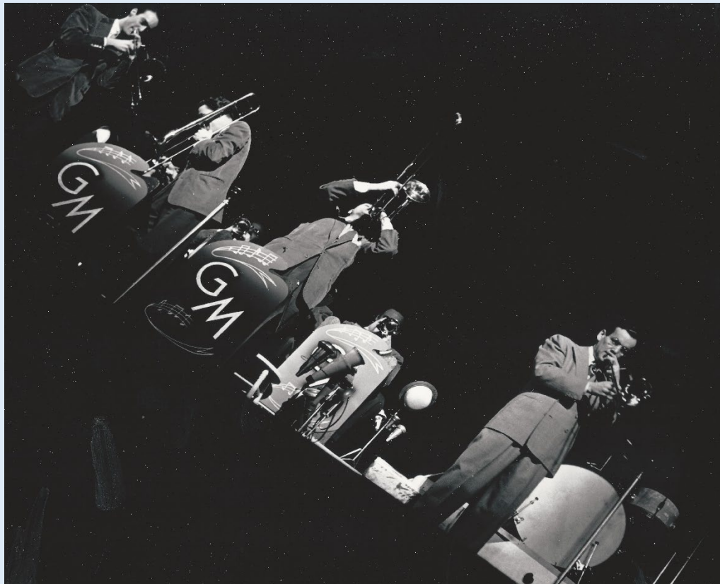
Paramount Theater New York