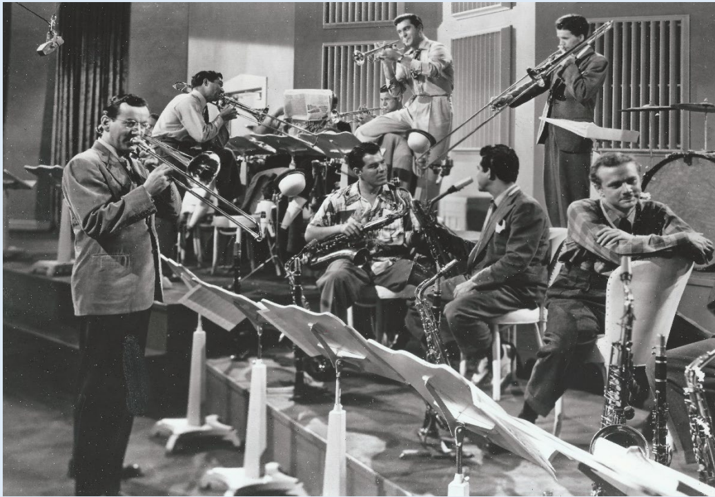
People Like You and Me - Opening Scene