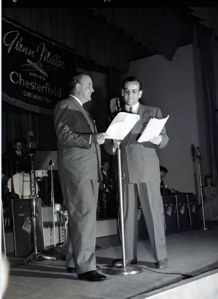
Don Wilson and Glenn Miller CBS Vine Street Radio Theater Hollywood