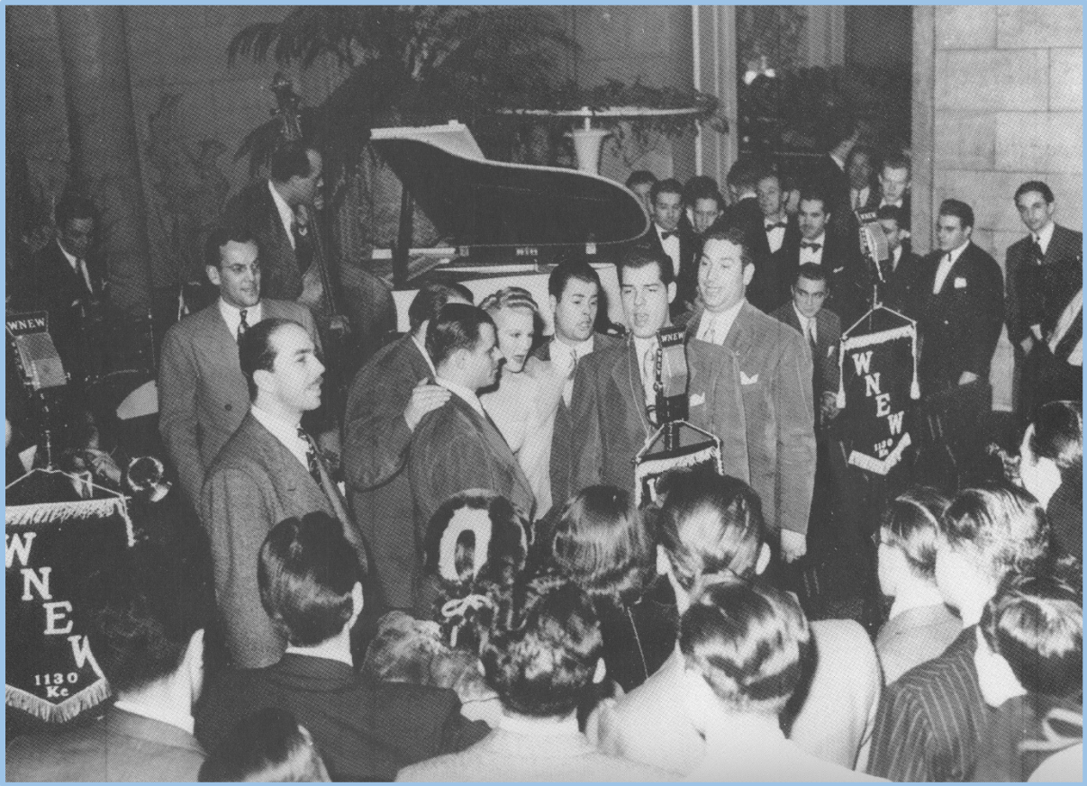
January 30, 1942 Starlight Ballroom Waldorf Astoria Hotel with host Martin Block