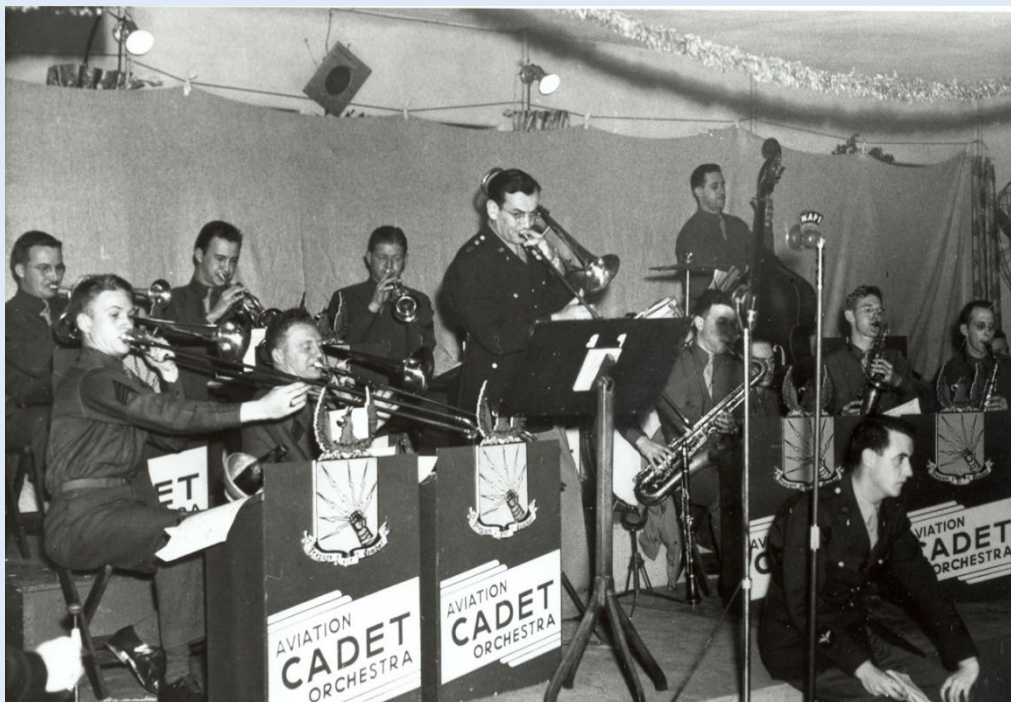
With the Rhythmaires, December 24, 1942

Amidst media speculation about Capt. Miller forming "the" official band of the AAF, on January 1, 1944, Glenn was assigned to the Army Air Forces Technical Training Command headquarters at Knollwood Field, Southern Pines, North Carolina, and detached to Atlantic City, New Jersey, to begin his now legendary service with the Army Air Forces. What "was to be" was about to begin.