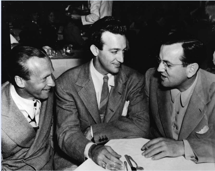
Sammy Kaye, Harry James and Glenn Miller