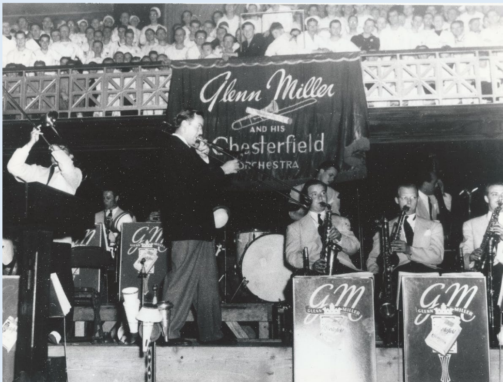
Great Lakes Naval Training Station

Wrapping up their stay on the west coast, Glenn and the band arrived in Chicago on May 25 and broadcast their early program from the Great Lakes Naval Training Station, where musician Cmdr. Eddie Peabody was stationed. Miller and Peabody privately discussed Miller's potential future plans, and Peabody promised to help Miller obtain a commission in the Navy. On June 20, Glenn applied for an appointment as a lieutenant in the Naval Reserve (the equivalent of an Army Captain). The Navy received letters of recommendation for Miller from, among others, Bing Crosby.